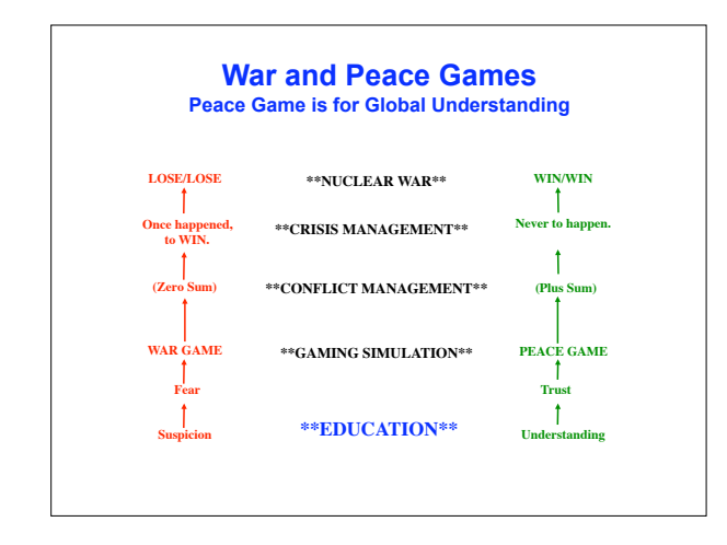
Figure 1: Comparison of War and Peace Games<sup>1</sup>

It was expected at that time that, in the near future, all the world's politics and economies would use computer models to examine the implications of an action on each of them. We already see the beginning of such models as the FUGI simulation model of the world in Japan. This is equivalent to say 'peace gaming' on the scale of Pentagon's 'war games' (See Fig. 1).