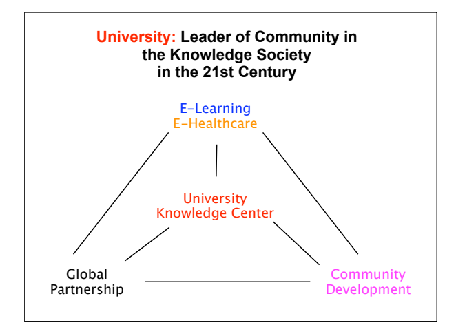
Figure 2: University as Leader of Community

stitutions. They foster the establishment of GUS in their respective regions, with the use of an advanced global broadband Internet virtual private network. These will then connect the universities with secondary and elementary schools, libraries, hospitals, local government offices and NGOs, etc., by broadband wireless Internet at drastically discounted rates. This advanced wireless communication with laptop computer will make e-learning possible for anyone, anywhere, and anytime with capabilities of Internet telephony, fax, voice mail, e-mail, Web access, videoconferencing, etc. This is not only to help local community development, but also to assure close cooperation among higher, middle and lower levels of education (See Fig. 2).